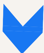
Ministry with boys living in difficult area